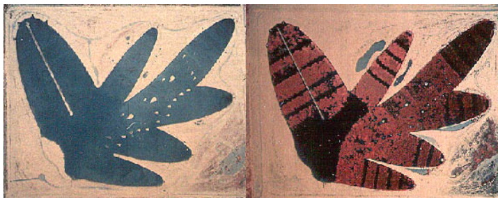
Color infrared aerial photographs illustrating the proliferation of emergent vegetation (California and hardstem bulrush) at the San Jacinto wetland between May 1995 (left panel) and May 1996 (right panel). Open water is light or dark blue. Emergent vegetation is red. The teardrop shaped objects are nesting islands for birds.

Biochemistry) studied the effects of the gradient in water quality in the San Jacinto wetland on the life history parameters of the western encephalitis mosquito, Culex tarsalis . Yvonne Offill (M.S. 1998) compared the efficacy of mosquito control provided a native larvivorous fish to the mosquitofish. Parker Workman