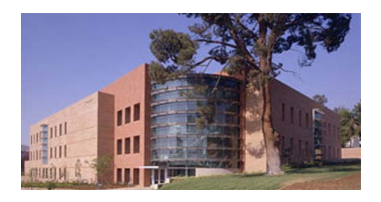
BY The Administrative Staff (Revised September 2019)