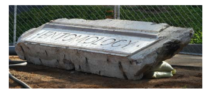
THE ENTOMOLOGY DEPARTMENT HAS MOVED!

With three new buildings completed in the past ten years, the Department of Entomology at UC Riverside has one of the most modern research facilities worldwide. We currently have 35 faculty that bring their individual and collective expertise to bear at the molecular, cellular, organismal and population levels. Our current research specializations include: arthropod vectors of plant pathogens, biological control, insect behavior, chemical ecology, ecology, morphology, pathology, pest management, physiology, insectplant interactions, systematics, toxicology, insecticide resistance, medical/veterinary entomology, molecular entomology, neuroscience, and urban entomology.