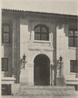
FRONT ENTRANCE, CITRUS EXPERIMENT STATION

WEDNESDAY, MARCH 27, 1918 RIVERSIDE, CALIFORNIA