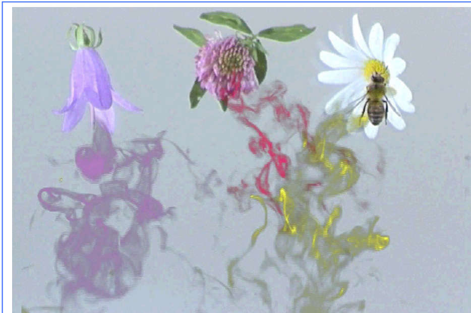
Cartoon view of a honeybee flying through a cloud of odors deriving from three flowers. Note the patchy and irregular distribution of odor plumes, leading to occurrences of low-concentration areas close to the source, as well as high-concentration areas far away. Also note that plumes can intermingle, creating imperfect odor mixtures, i.e. mixtures where the relative concentration of the components varies in time and space. An animal able to navigate in an olfactory environment needs to process a rapidly changing and highly complex landscape of odor plumes.

with confidence. The combinatorial logic greatly expands the coding capacity of the system: if each glomerulus (or receptor type) were used exclusively for a single odor, Drosophila , with its 43 glomeruli, would cover an olfactory space of a mere 43 odors. By exploiting its combinatorial power, it can code a much greater variety.