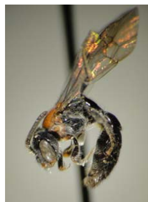
Newly described ectoparasitic sweat bee Eupetersia yanegai Pauly, 2012. Collected in Thailand.

THE ENTOMOLOGY RESEARCH MUSEUM DISCOVERS SEVERAL NEW INSECT SPECIES FROM AROUND THE WORLD EACH MONTH!