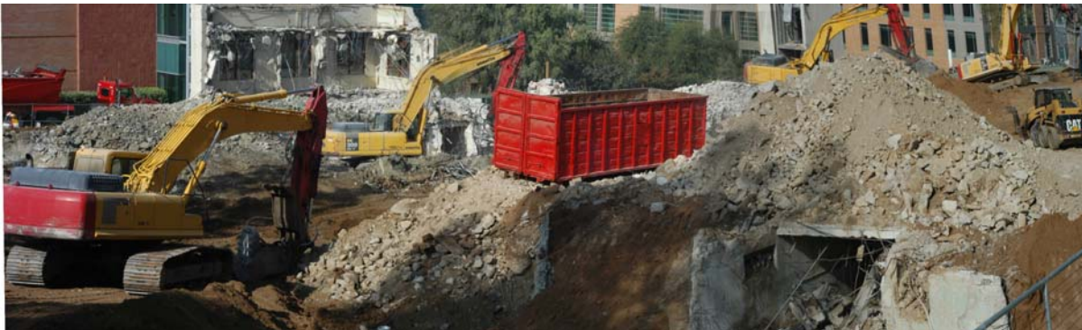
DEMOLITION OF THE "OLD" ENTOMOLOGY BUILDING

Our alumni and friends who have not been on campus for some time may be surprised at the structural changes that have occurred on campus in the last decade. With the expansion of campus to the north and west, the construction of a new Student Union Building and Commons, and the movement of the Entomology Department from the "old Entomology Building" to the "new Entomology Building", you may need to pick up a campus map to find your way around! Below are highlighted just a few of the changes of most significance to Entomology.