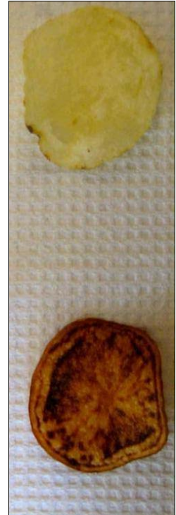
Potato chips from a healthy (top) and infected tuber.