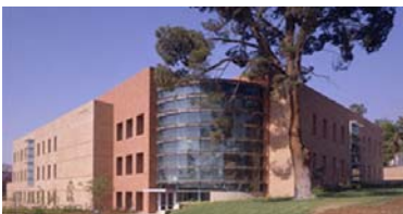
NEW ENTOMOLOGY BLDG

This unique building has receiving rooms, five research labs, 10 greenhouses and 52 rearing rooms at Biosafety Levels 1- 3 enabling scientists to safely investigate exotic parasites, microorganisms and predators, as well as genetically engineered organisms.