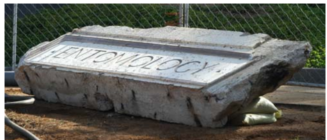
THE ENTOMOLOGY DEPARTMENT HAS MOVED!

range of interests from molecular entomology through population biology to systematics. The new building also houses the Department's administrative space and conference rooms for meetings and some class instruction. In 2010, the old Entomology Building adjacent to Picnic Hill was finally demolished and replaced with the School of Medicine Research Building.