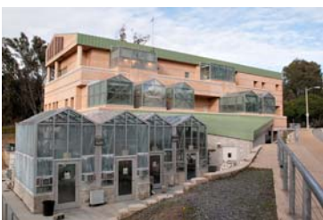
INSECTARY AND QUARANTINE FACILITY

With three new buildings completed in the past ten years, the Department of Entomology at UC Riverside has one of the most modern research facilities worldwide. We currently have 35 faculty that bring their individual and collective expertise to bear at the molecular, cellular, organismal and population levels. Our current research specializations include: arthropod vectors of plant pathogens, biological control, insect behavior, chemical ecology, ecology, morphology, pathology, pest management, physiology, insect-plant interactions, systematics, toxicology, insecticide resistance, medical/veterinary entomology, molecular entomology, neuroscience, and urban entomology.