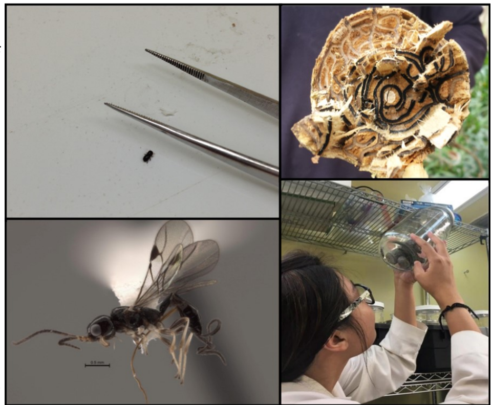
Top left: A polyphagous shot hole borer female, with forceps for scale. Bottom left: A braconid parasitoid ( Simuatothorus sp.), one of the potential biological control agents recovered from Taiwan. Top right: Shot hole borer galleries penetrate a log, showing growth of symbiotic (white) and contaminating (black) fungi. Bottom right: Iris Chien checks for parasitoid wasp emergence from logs in the UCR I&Q Facility.

By Christine Dodge (Stouthamer lab) and Michele Eatough Jones (Paine lab)