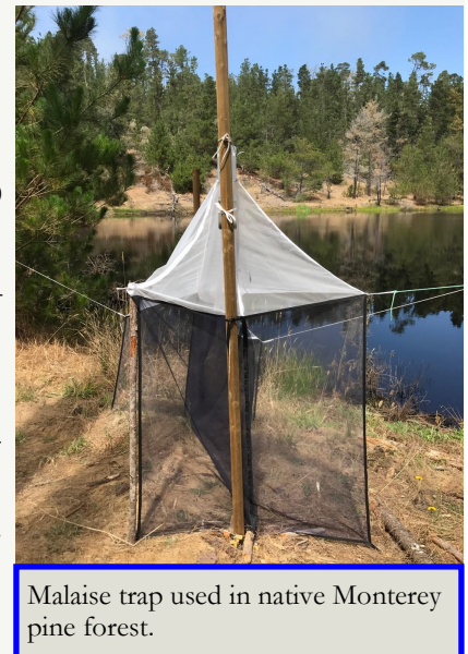
Malaise trap used in native Monterey pine forest.

For outreach, particularly notable was the exclusive tour of the Entomology Research Museum for Chancellor's Associates members on March 23, 2017.